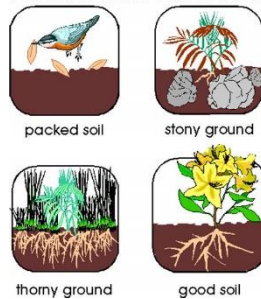
A Sower Went Out to Sow

patch of weeds and was hoping that this recently cleaned patch would now bear fruit. I am sure the farmer scattered some of his good seed among the thorns and weeds.